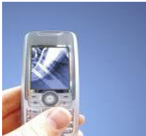
E-mail, text messaging, postal mail and phone correspondence are all options

automatically receive it one day prior to your appointment notifying you of the date and time of the appointment. For your convenience, our phone number will appear on the text to quick link a call to us if necessary.