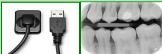
Digital X-ray sensor