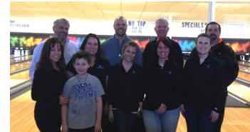
The Hammerlee Dental Care Hometown Heroes Bowling Teams