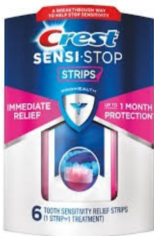
Crest Sensi-Stop strips