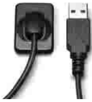
Digital x-ray sensor

Digital x-ray imaging uses digital sensors instead of traditional photographic film. This exciting technology has many advantages: