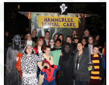
Zoo Boo 2015

The Hammerlee Dental Care booth handed out toothbrushes, toothpaste and floss and the Tooth Fair was even spotted most evenings!