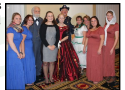
The HDC team in Gettysburg